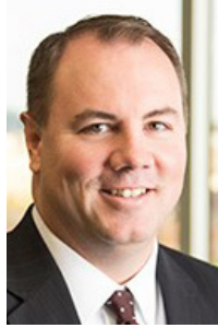
Roger Meyers Bush Seyfereth PLLC